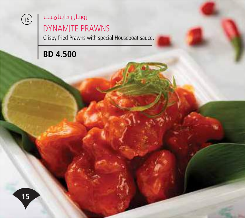
15 روبان ديناميت DYNAMITE PRAWNS Crispy fried Prawns with special Houseboat sauce. BD 4.500