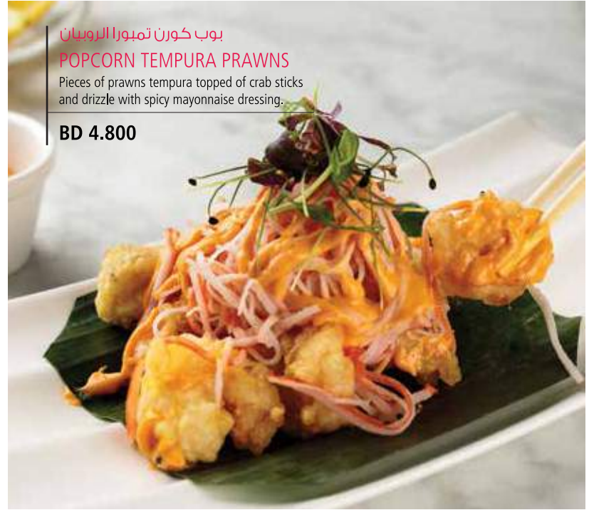
بوب كورن تمبورا الروبان POPCORN TEMPURA PRAWNS Pieces of prawns tempura topped of crab sticks and drizzle with spicy mayonnaise dressing. BD 4.800